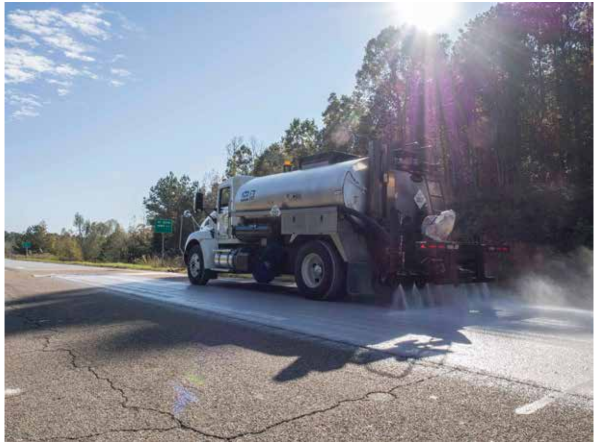
Delta Mist rejuvenator is applied to Section S3 of the NCAT Test Track.

A rejuvenating fog seal is a type of pavement preservation treatment applied to an existing asphalt pavement surface to preserve its functional and structural integrity and delay a more costly rehabilitation treatment in the near future.