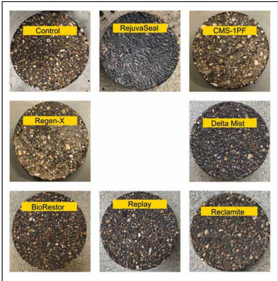
Surface of extracted cores from the NCAT preliminary study four weeks after application of the rejuvenating fog seal treatment.

before the rejuvenating seal treatment is applied. After three hours of curing, friction values similar to those prior to application should be obtained. After four days of curing, the rejuvenating seal should have no adverse effects on friction.